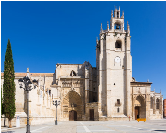
▲ PALENCIA CATHEDRAL

Spain is a country full of treasures and secrets. Here are 10 cultural gems that are waiting for you to discover them.