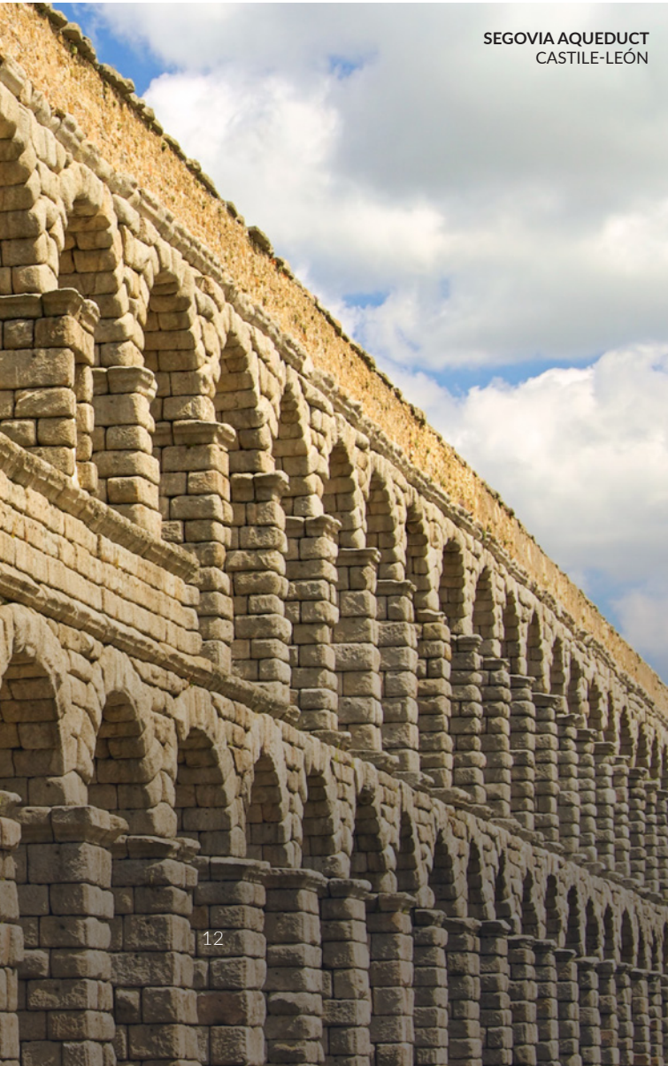
SEGOVIA AQUEDUCT CASTILE-LEÓN