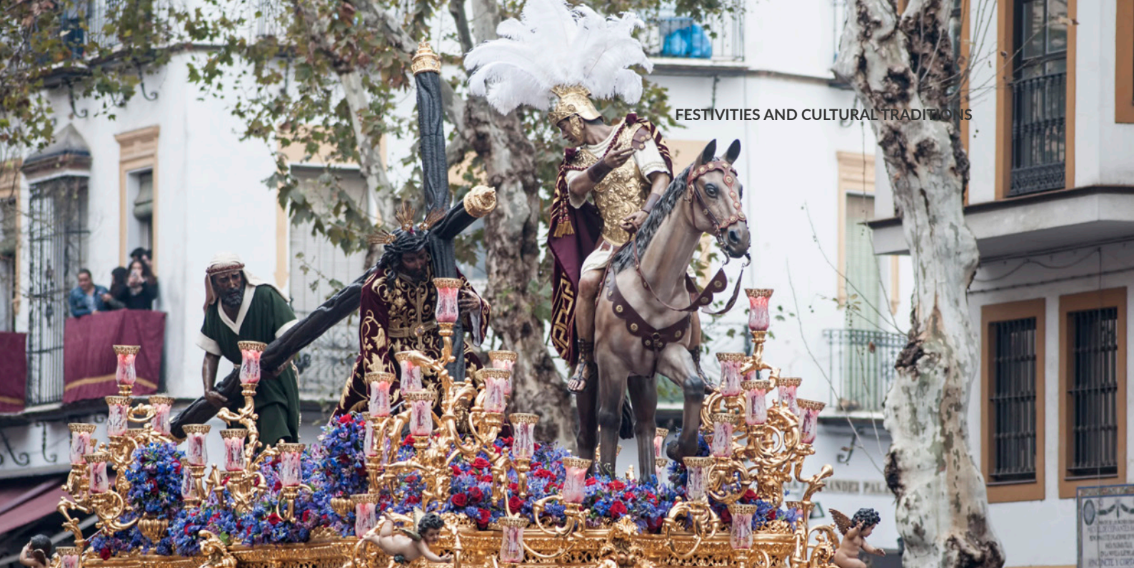
▲ EASTER WEEK IN SEVILLE