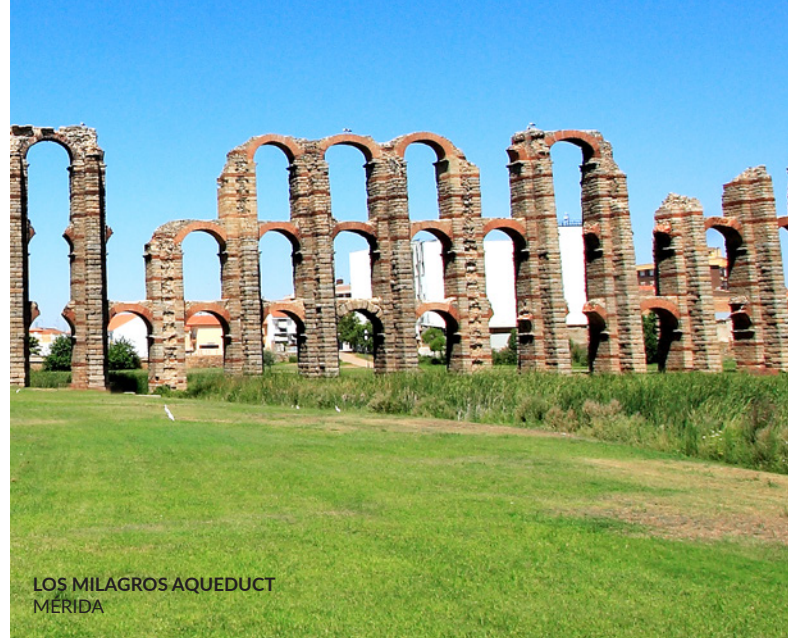
LOS MILAGROS AQUEDUCT MÉRIDA