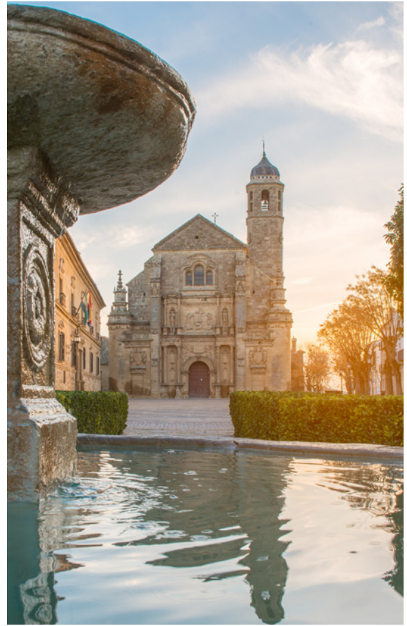
▲ CHAPEL OF EL SALVADOR ÚBEDA, JAÉN

The old part of the Balearic city of Ibiza, known as Dalt Vila , has been designated a World Heritage Site by the UNESCO. You can walk along the Renaissance walls that encircle it, whose original purpose was to defend it from attack by the Turks in the 16th century.