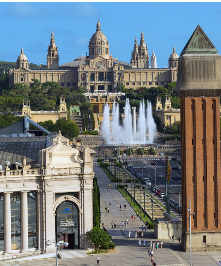
▼ MNAC BARCELONA