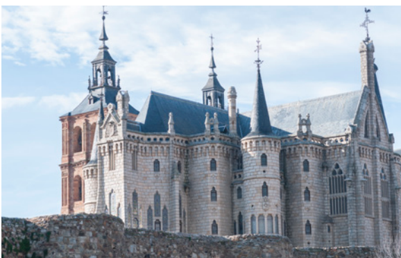
▲ EPISCOPAL PALACE ASTORGA

You'll think you're looking at a fairytale castle, with its battlements, peepholes and even a moat around the whole monument. This modernist building in the neo-Gothic style was designed by the architectural genius Gaudí and currently houses the Los Caminos Museum.