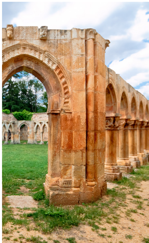
▲ CLOISTER IN SAN JUAN DE DUERO SORIA

Discover this example of mediaeval Christian architecture. Its arches reveal the different architectural tendencies that could be seen in Spain at that time: Romanesque, Gothic and Muslim.