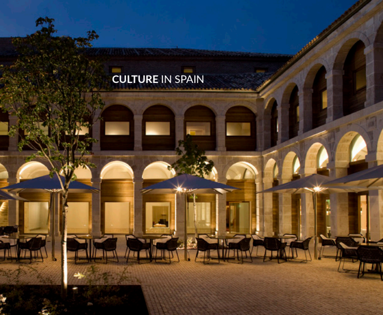
▲ PARADOR HOTEL IN ALCALÁ DE HENARES MADRID