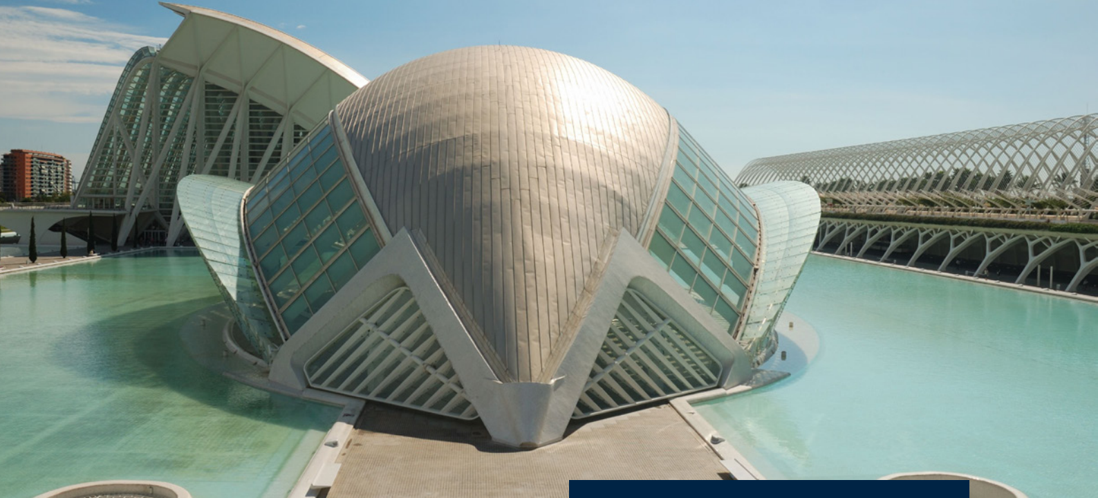
▲ CITY OF ARTS AND SCIENCES VALENCIA