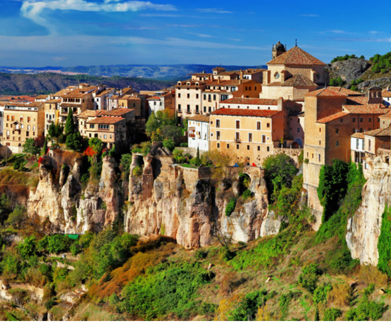
▲ HANGING HOUSES CUENCA