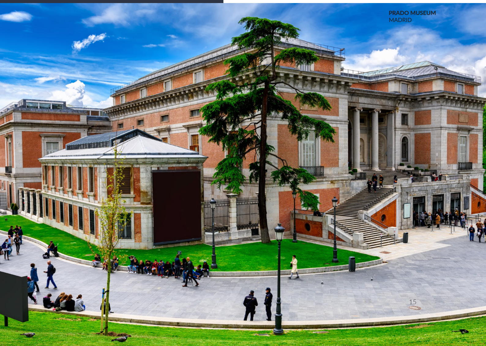
PRADO MUSEUM MADRID

Here you'll find treasures like Las Meninas by Diego Velázquez; The nobleman with his hand on his chest by El Greco; and The Garden of Earthly Delights by Hieronymus Bosch.