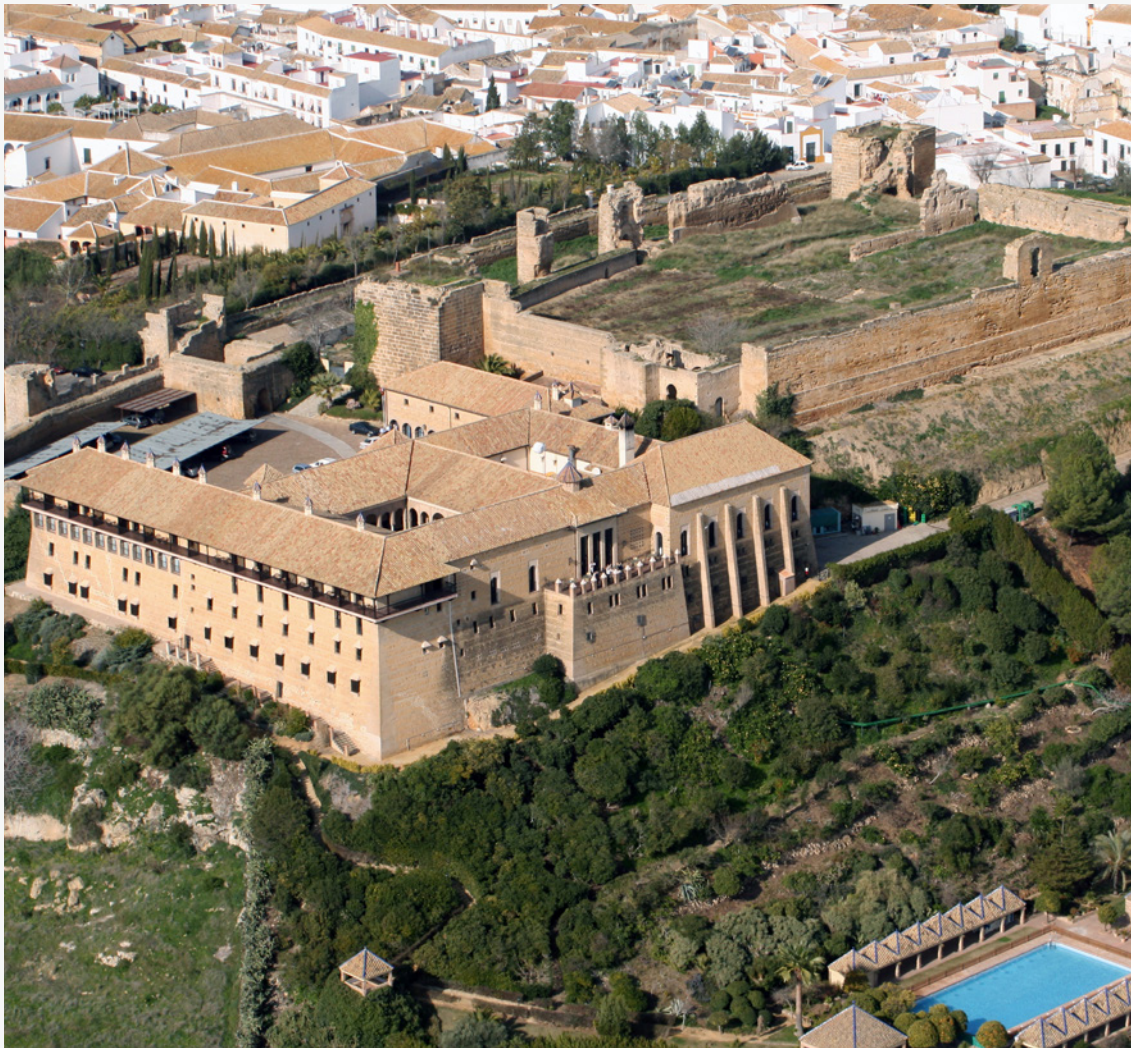
▲ PARADOR HOTEL IN CARMONA SEVILLE

There are currently over 90 Parador hotels in Spain. If you like the idea of experiencing history up close, this is the option for you. Find the one for you at www.parador.es .