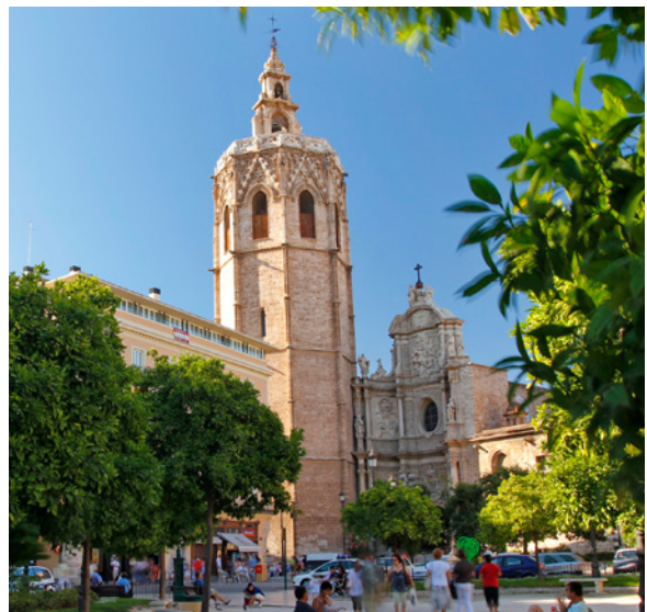
▲ EL MIGUELETE VALENCIA

This city with all its contrasts is the essence of the Mediterranean.