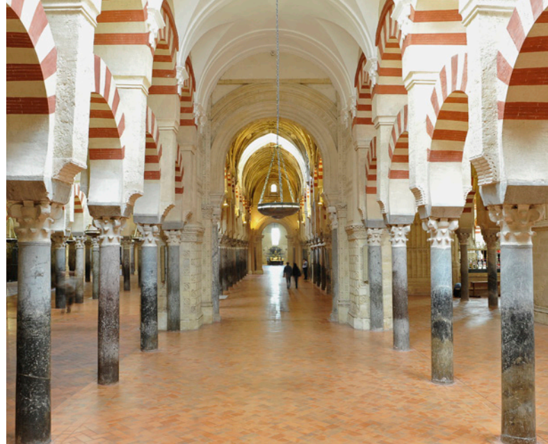
▲ INTERIOR OF THE GREAT MOSQUE IN CÓRDOBA