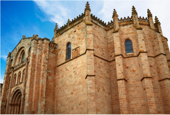
▲ ZAMORA CATHEDRAL